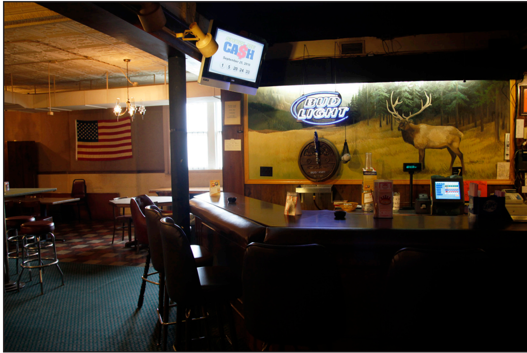
The bar in the basement of the lodge.